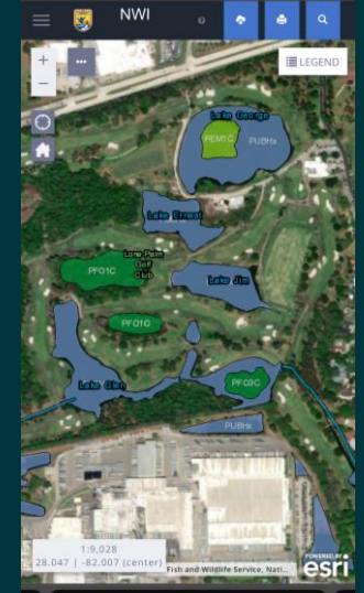
National Wetlands Inventory screenshot of water bodies within golf course area