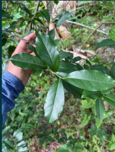
Researching plant species to understand wetland indicator status