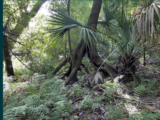
Tree within wetland that displays evidence of water ponding/flow