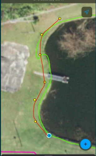
Wetland Delineation around water body