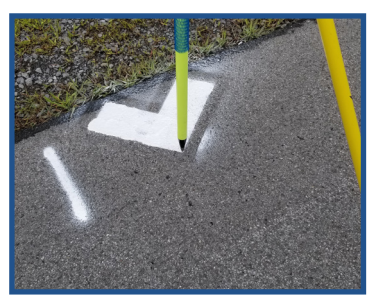
Ground Check Point (GCP) Arrow